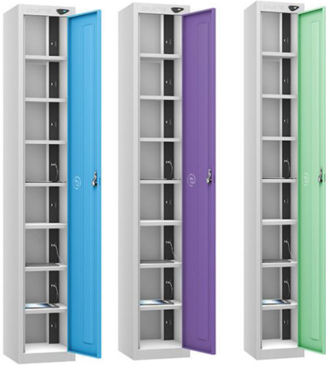
Pure Tablet Charging Lockers - 1 door - 8 compartments

These Pure Tablet Charging Lockers come with 8 compartments behind 1 door. Available in 13 unique colours, our lockers are ideal for schools, workplaces and offices. Choose from either 3-pin or USB and/or USB-C, ensuring your tablet charging needs are met.