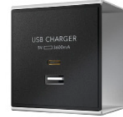
USB and USB-C Socket